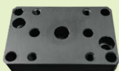
Adapter H4 for KK1 mounting on tilt stage